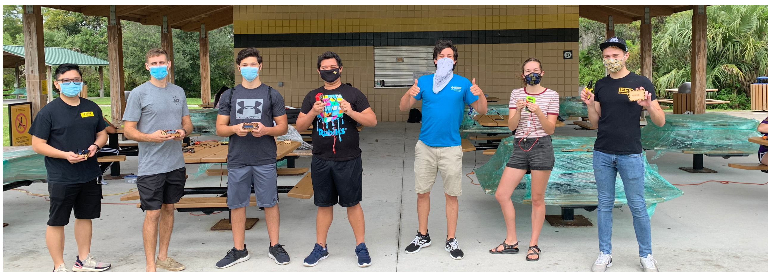
Our 2020-2021 Solar Charger Team

It is time to embrace ambition! We are poised to continue our great successes into the next year, and we want you to tag along with us! Please read through the remainder of our Sponsorship Packet for what we have to offer and how you can be an integral part of our mission to bring the highest quality experiences to the next generation of stellar engineers!